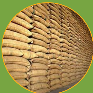
Massive Storage Capacity