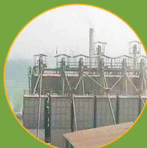
Advanced Processing & Milling