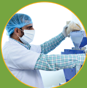
Research & Development