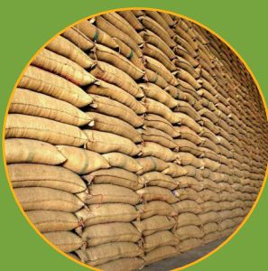
Massive Storage Capacity