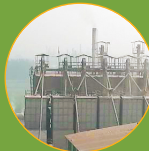
Advanced Processing & Milling